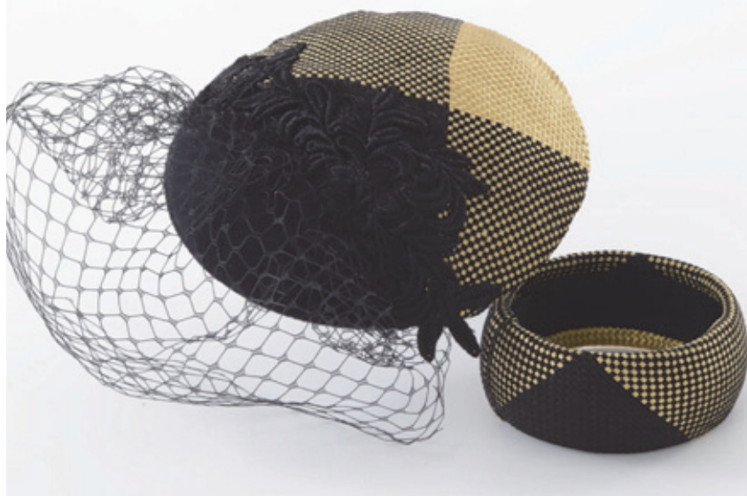
kumihimo craftsman RYUTA FUKUDA